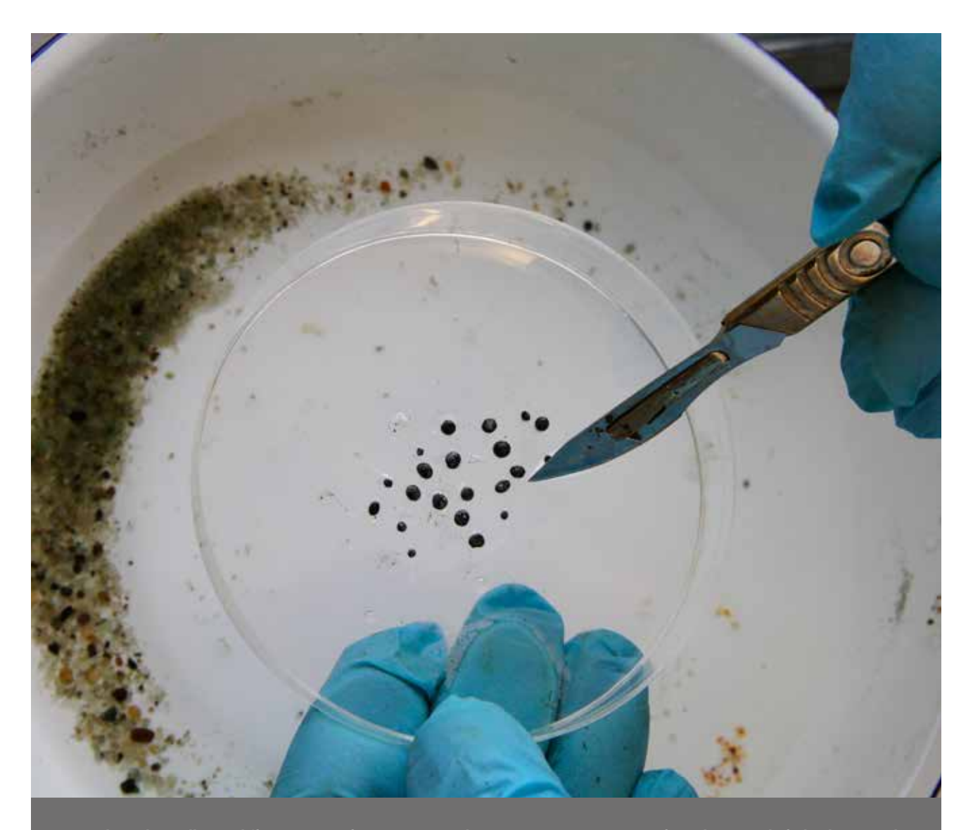
Lead gunshot pellets in different states of erosion removed at post mortem examination from the gizzard of a lead poisoned swan found in England 15 years after introduction of regulations aimed at reducing lead poisoning.

WSSD (2002). Plan of Implementation of the World Summit on Sustainable Development. 62pp. World Summit on Sustainable Development. Johannesburg. Available at: http://www.sidsnet.org/sites/default/files/ resources/jpoi_l.pdf. Accessed: August 2015.