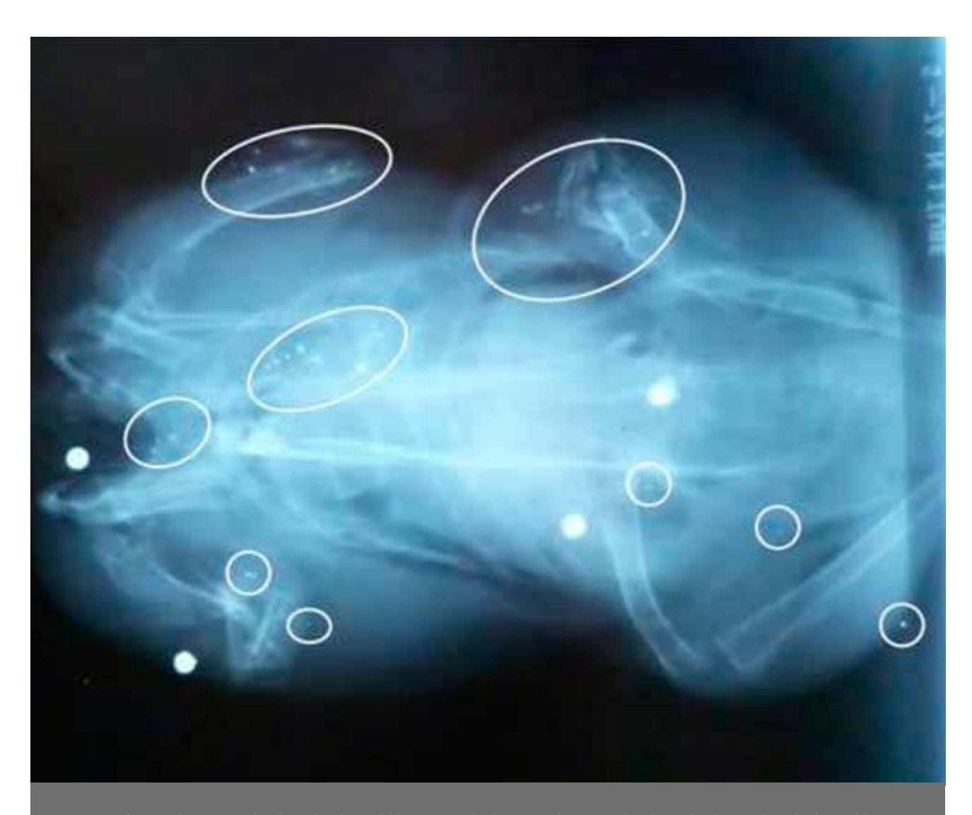
X-ray of a wood pigeon Columba palumbus sold by a game dealer: note the tiny radio-dense lead particles which would go unnoticed by the consumer.

ZIA MH, CODLING EE, SCHECKEL KG, CHANEY RL (2011). In vitro and in vivo approaches for the measurement of oral bioavailability of lead (Pb) in contaminated soils: a review. Environmental Pollution 159(10), 2320-2327.